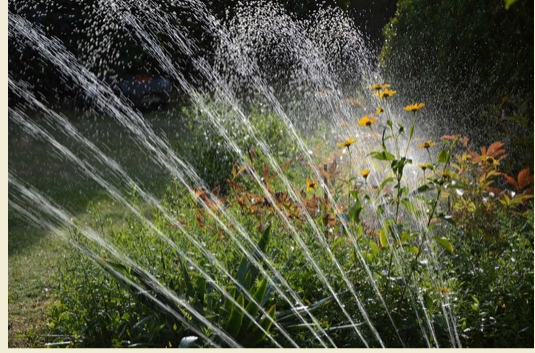
Water early in the morning or wait until sunset.

1. No matter how much you care for some plants, only those that are native or adapted to hot dry climates will come back. Next time you are purchasing plants, look for those that love the heat. There are thousands of shrubs, trees and ground covers that thrive in our climate. Visit the website El Paso Desert Blooms to learn about plants that love our Chihuahuan Desert.