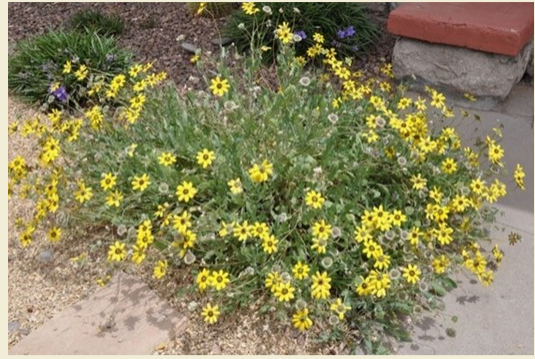
Select drought tolerant or native plants like the Chocolate Flower.

In the Chihuahuan Desert, we are accustomed to an arid climate with only 9 inches of rain per year. This year we saw record hot temperatures in June. We are also experiencing a river drought with only half the normal months of water in the Rio Grande. El Paso Water has urged customers to be Water Smarter this year. Given the hot, dry summer ( at least so far ), it can be hard on our landscapes. How can you be Water Smarter ?